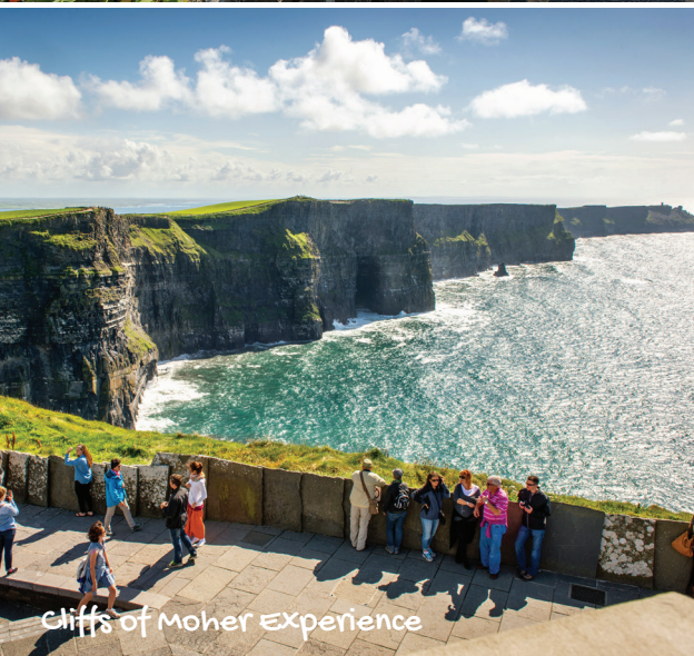
Cliffs of Moher Experience